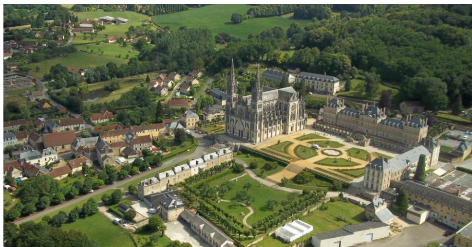
Aerial view of the shrine and its surroundings

Reception desk: 00 33 2 33 85 17 00 reception@montligeon.org www.montligeon.org