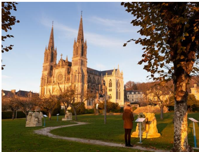
Shrine of Our Lady of Montligeon - View of the basilica from the Way of Consolation.