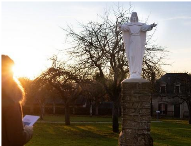
At the onset of the Way of the Resurrection – RC shrine of Montligeon (France)

Meditating on the resurrection of Christ at the shrine of Christian Hope.