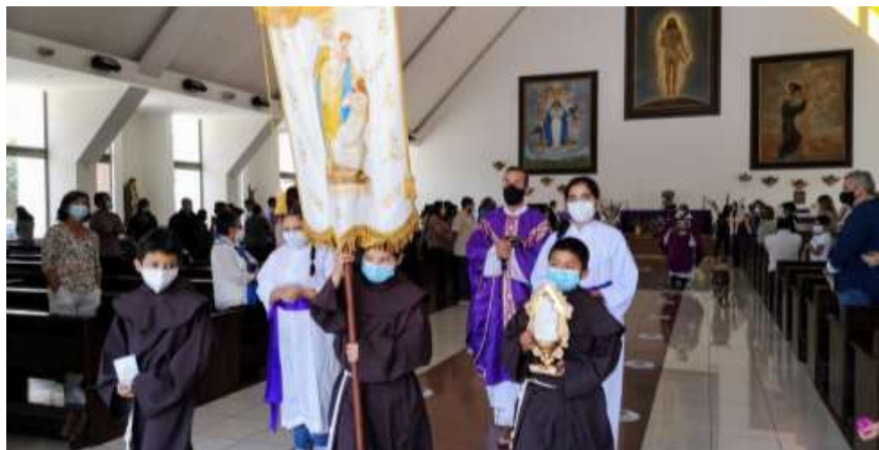
The Fraternity of Our Lady of Montligeon in Guatemala

The Fraternity of Our Lady of Montligeon is an association erected as Archconfraternity by Pope Leo XIII in 1893. Its main purpose is to pray for the souls in purgatory, especially the most neglected. Present on all continents, the spiritual Fraternity invites its members to pray and engage people to pray for the deceased, as well as all people recommended to it.