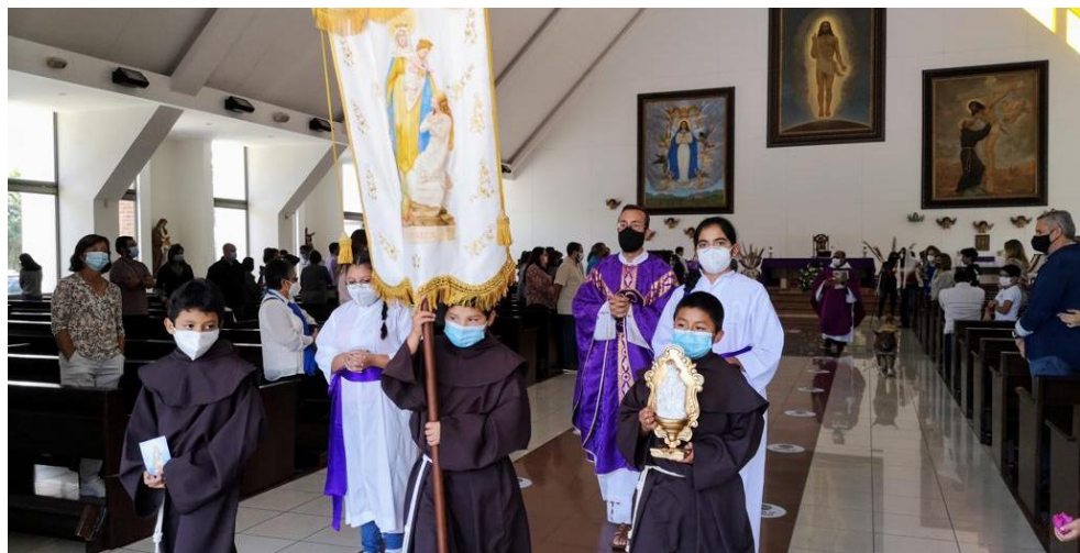
The Fraternity of Our Lady of Montligeon in Guatemala

The Fraternity of Our Lady of Montligeon is an association erected as Archconfraternity by Pope Leo XIII in 1893. Its main purpose is to pray for the souls in purgatory, especially the most neglected. Present on all continents, the spiritual Fraternity invites its members to pray and engage people to pray for the deceased, as well as all people recommended to it.